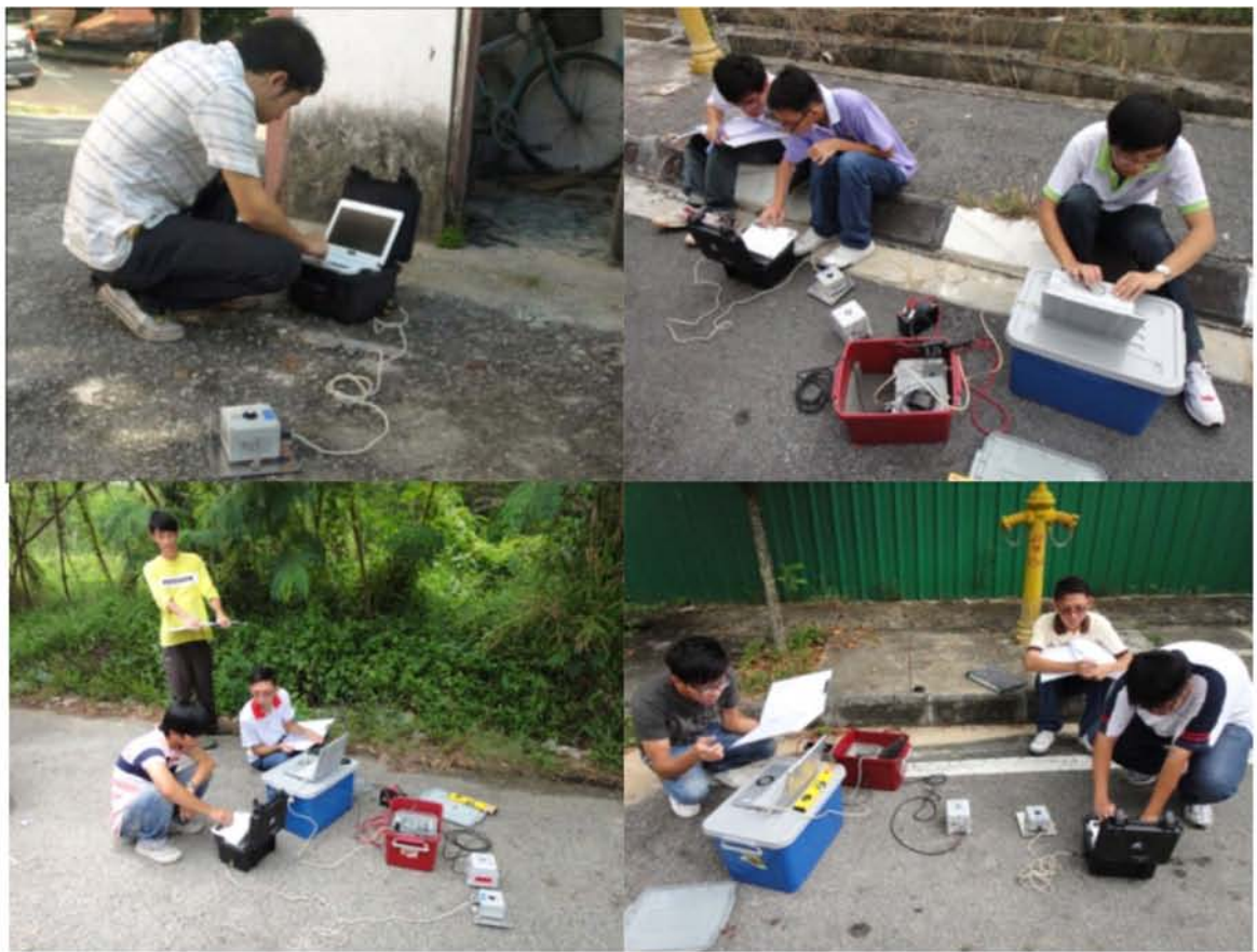
Figure 1 Single point microtremor observation

Single point observation using microtremor instrument was carried out from March to August 2012. A total of 322 points were measured in the eastern part of Penang Island. The observation points are located within 500 m to 1000 m apart. Figure 1 shows the microtremor observation at various locations in Penang Island. The sensor is placed on the ground to measure the ground motion in three directions at the same time. Microtremor measurement is recorded for three to five minutes by data logger. After the measurement, Fourier spectrum for each component is calculated using MATLAB program. From the spectra ratio of horizontal to vertical component, the predominant period and the amplification factor of the ground at that particular site are obtained and mapped.