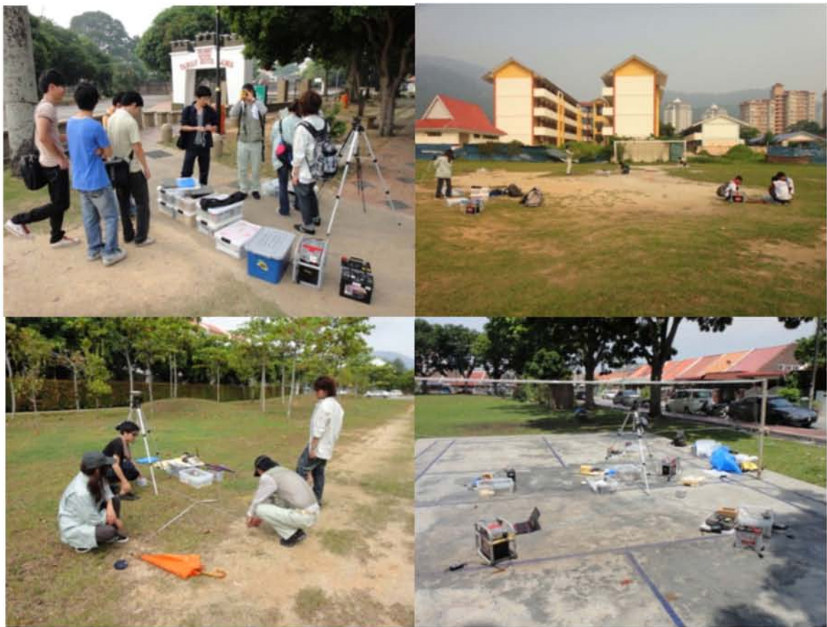
Figure 2 Microtremor array observation